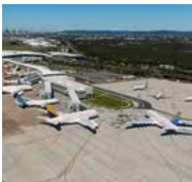
International Terminal Concourse and Northern Apron expansion projects due for completion late 2017.