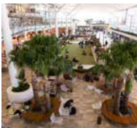
International Terminal retail redevelopment.

Brisbane Airport Corporation (BAC) is investing $3.8 billion over a decade redeveloping and expanding Brisbane Airport (BNE).