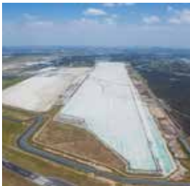
New Parallel Runway currently under construction, due for completion in 2020.