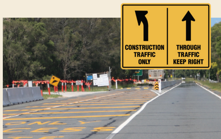
Airport drive inbound