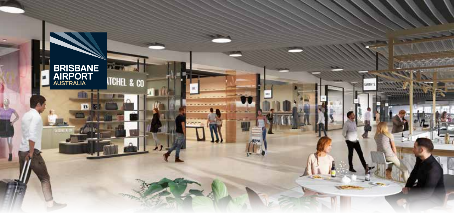
High Street Artist Impression