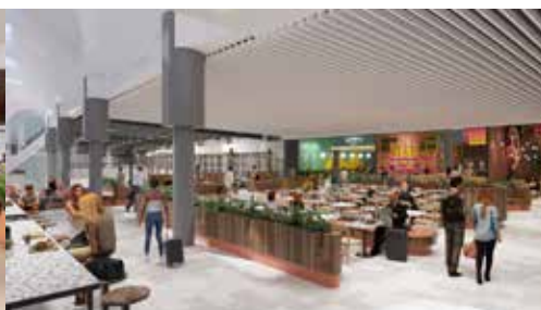
Qantas Cafe Court