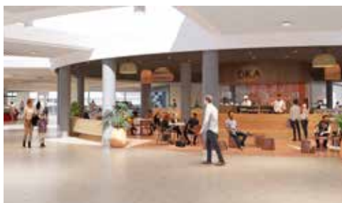
Qantas Terminal High Street

Artist impressions of the proposed redevelopment. Images are illustrative only and subject to change.