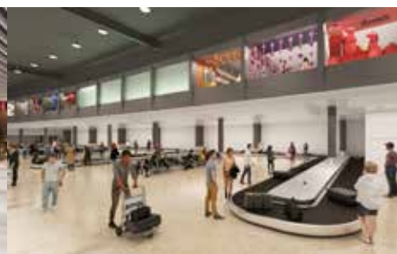
Central Terminal Baggage Collection