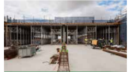
Construction of the underpass