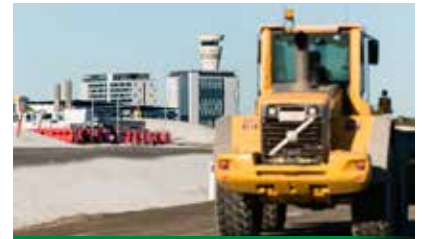
View from the site