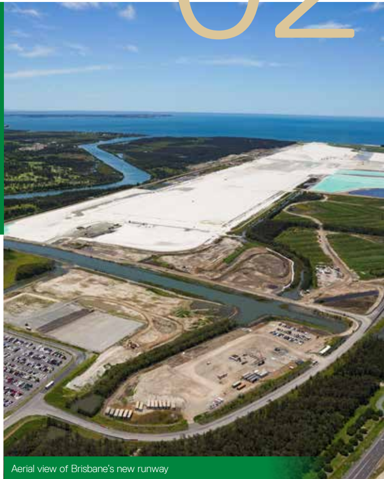
Aerial view of Brisbane's new runway

Welcome to the second edition of Take Off , keeping you updated on Brisbane's new runway. Take Off covers all the major milestones as we head towards the opening of the runway in 2020.