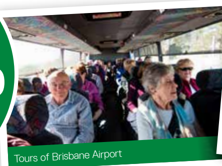
Tours of Brisbane Airport