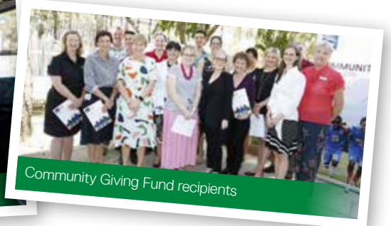
Community Giving Fund recipients