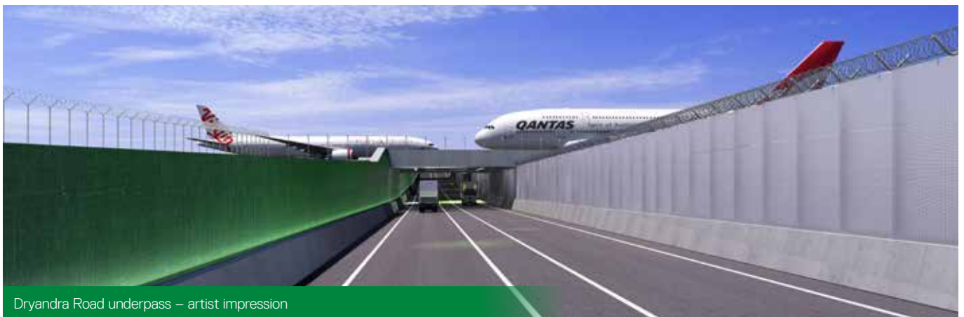
Dryandra Road underpass – artist impression

CEO and Managing Director Brisbane Airport Corporation