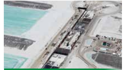
Dryandra Road site aerial