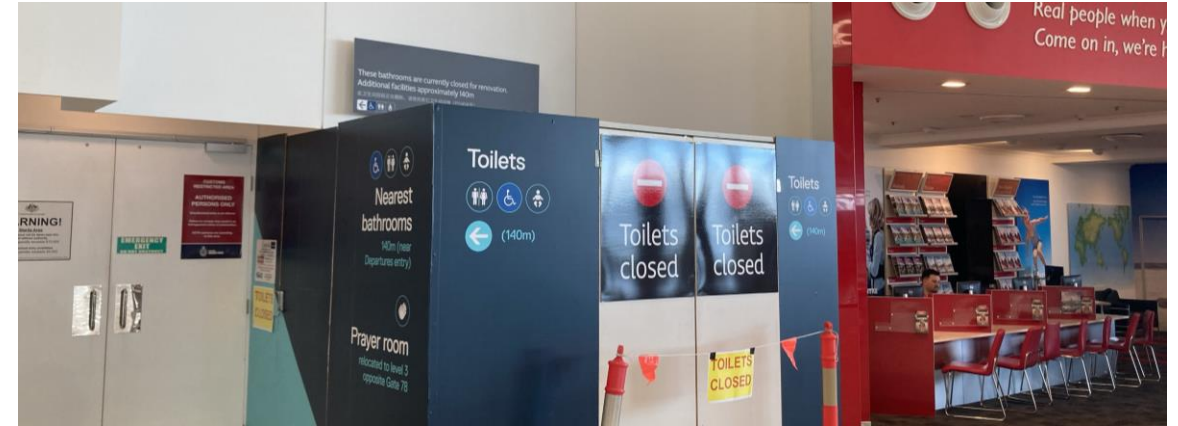
Toilets near Flight Centre on Level 4 are closed.