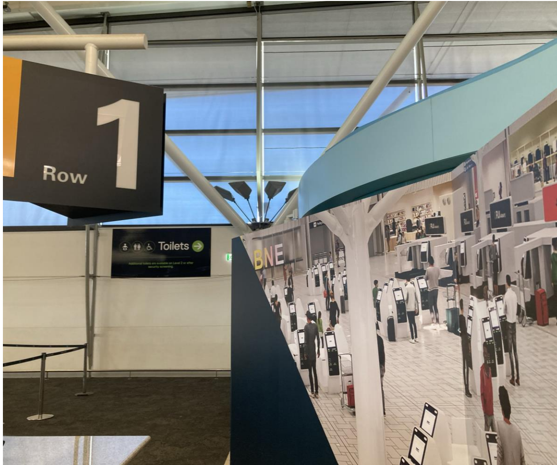
Toilets on level 4 at the back end of check-in rows 1-2 are open.