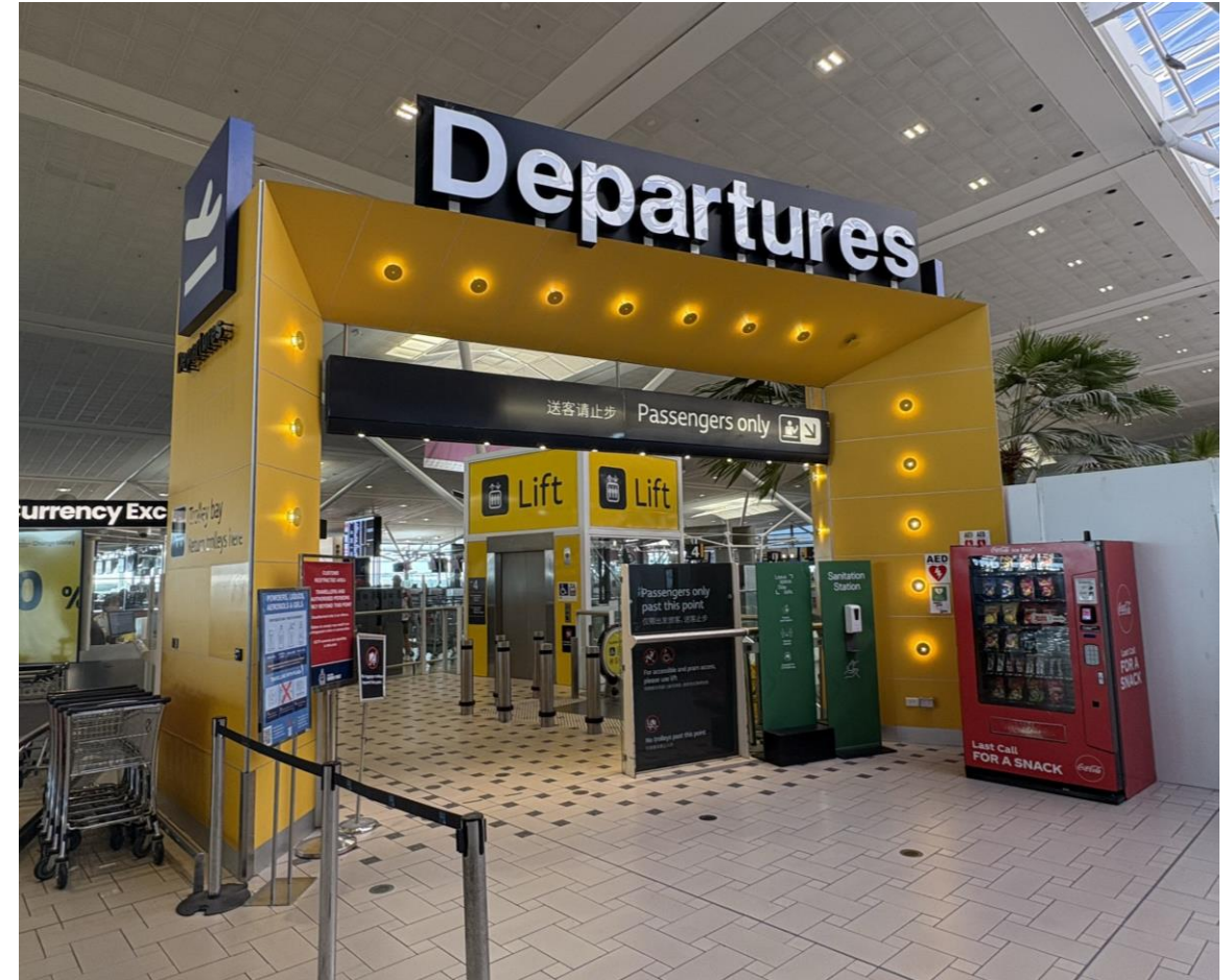
Proceed to Level 3 departures screening after check-in on Level 4.