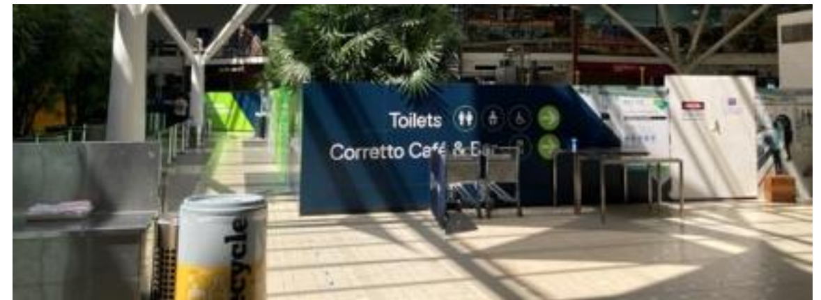
Toilets on Level 4 near viewing terrace are closed.