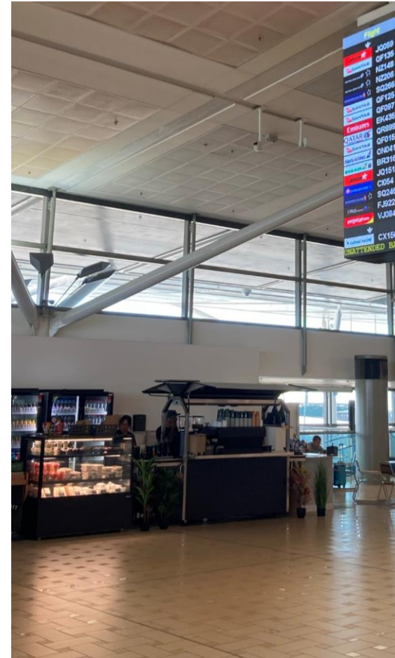
Fonzie Abbott & Elra Coffee are open in front of rows 7- 8 and 4. L4 food court is closed.