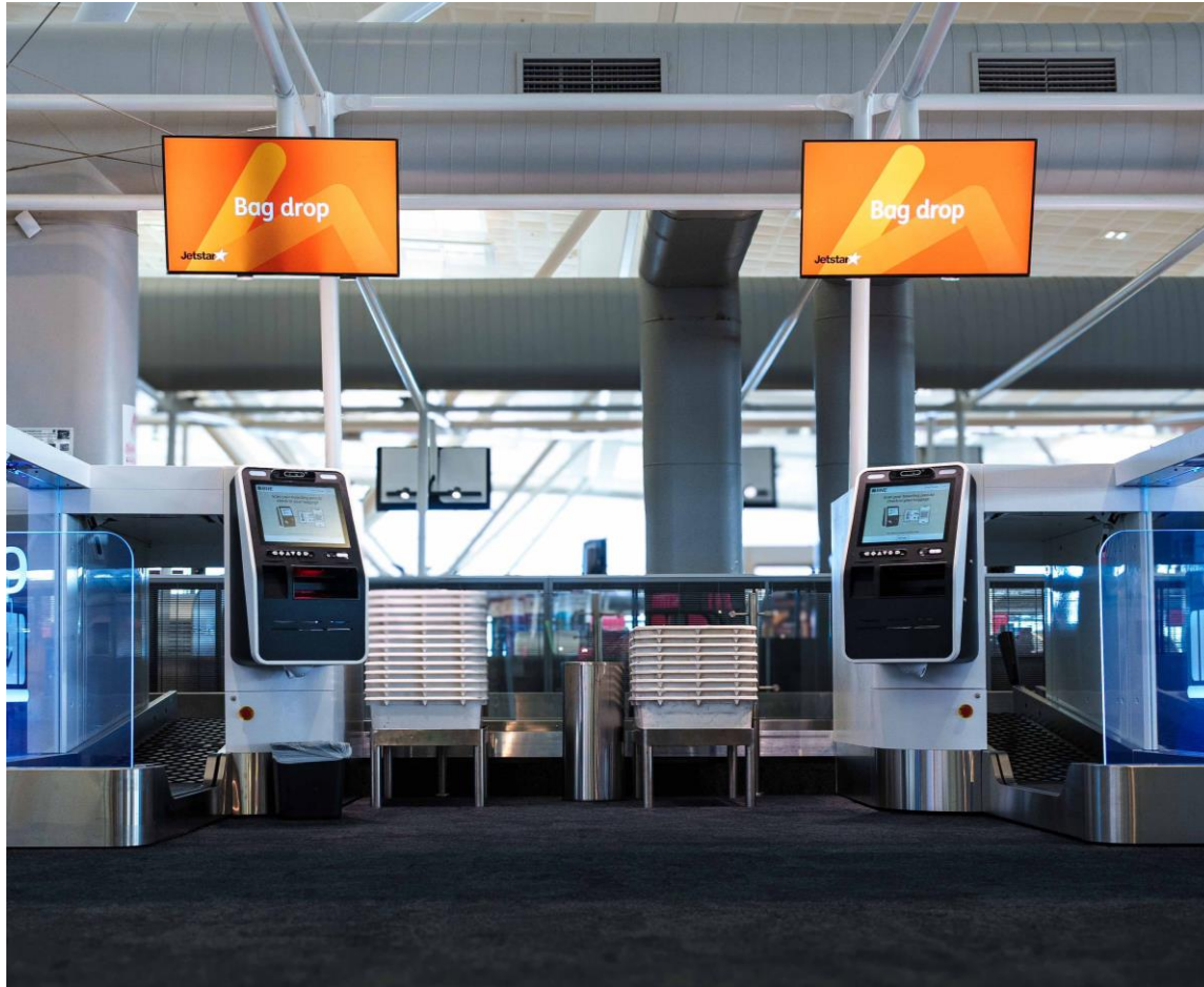
Proceed through Level 4 check-in and bag drop rows.