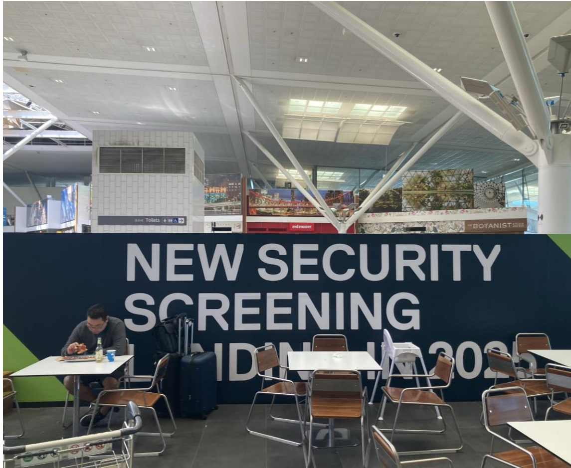
Hoarding is in place on Level 4 terrace for future screening equipment.